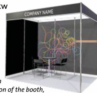
This is an impression of the booth, no rights can be drawn from this image.